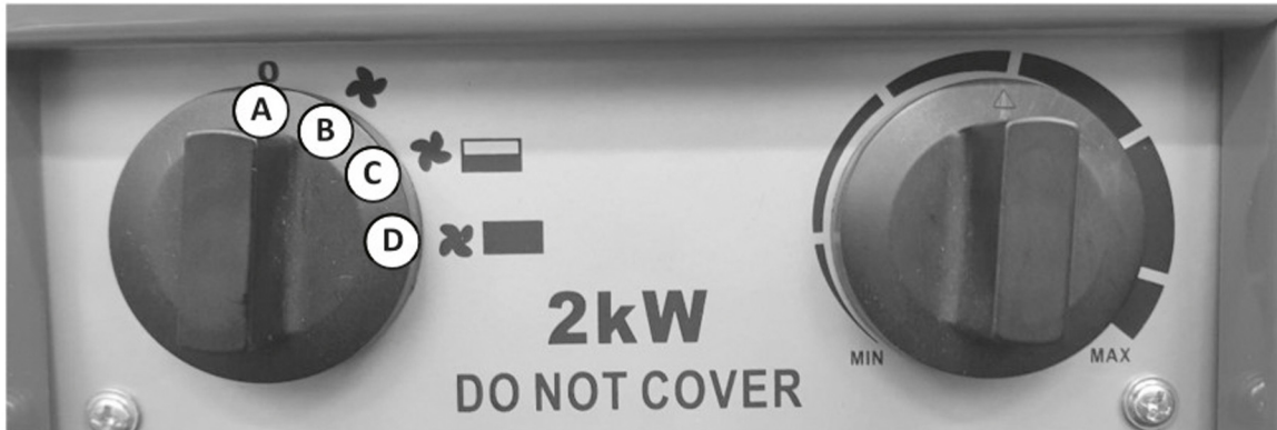
Figure 1 - Control panel: mode selector dial (left) and thermostat dial (right)